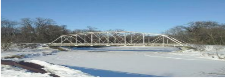
"where the path from the past & the future meet"